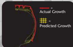
The actual tire growth is precisely predicted.