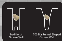
Funnel Shaped Groove Wall