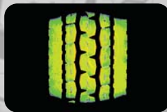
703ZL Footprint: indicates even contact pressure across the tread's shoulder and central section.