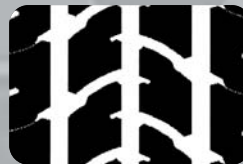
Distinctive Directional Tread Design