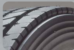
Stress Wear Control Rib