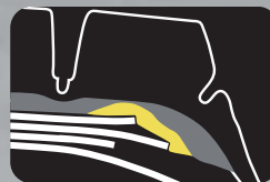
Edge Cover Sheet